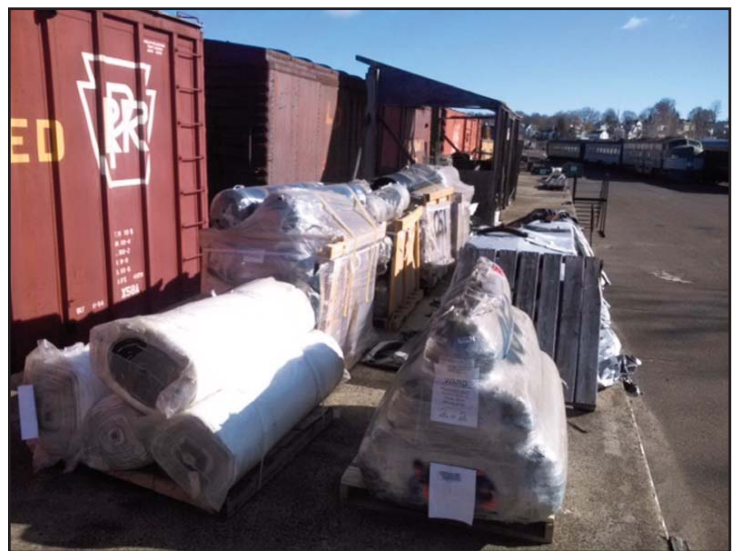
Donated track mats from Metro-North on loading dock.

The outlined location opposite of the loading dock where the Mill Plain Station is to be located. In the photo, the mail bag stand has already been moved to its new location. After this photo was taken, the RPO car was moved out of the way down the track and positioned so the stand would line up with the mail bag catcher doorway (door with circle window on right).