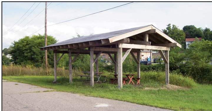
Photo showing the extended trackage in our railyard, and at right, the pavilion now with decking on the roof.

Gil Letellier has been busy with a number of projects, one of which is the pavilion at the end of track 42, which will soon have a roof. This will afford shelter from the sun for those who wish to de-train and re-board a later train. I have been encouraging train crews and car hosts to advise riders that they can ride as often as they want (that day) by presenting their tickets again. This practice doesn't apply for special events, but we have had plenty of room on our regular weekend trains to do this.