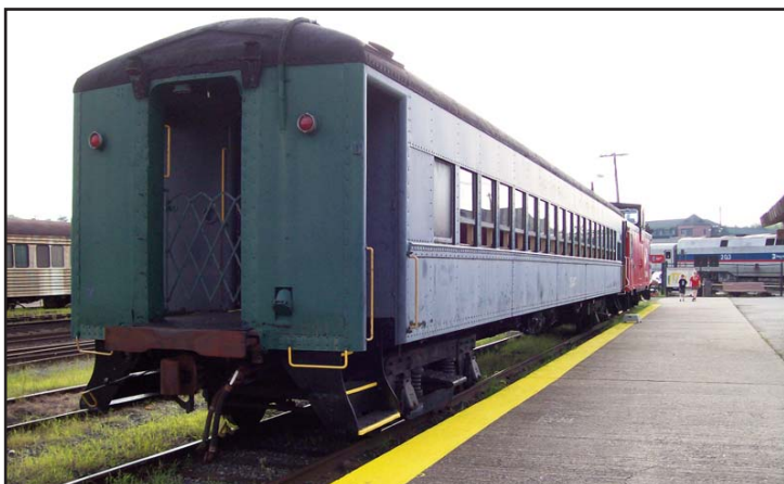
Top left, Bob Boothe, top right, Harry Leeds on the 1455, brushing on the historically-accurate color, and left, the finished result; above, Gerry Herrmann removing paint from wooden pieces from the NYCHRR caboose; left, the bright yellow safety line at Track 18; below left, the proposed footprint for re-erection of the Botsford water tower; below, progress on trackwork