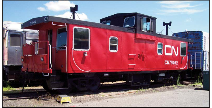
Left, the Museum’s new way to keep track of progress on projects; above, the RED CN caboose; below, progress on the Rutland flatcar with its restoration and maintenance from the trucks up to its deck; Jeff Van Wagenen relates information about trucks and bearings