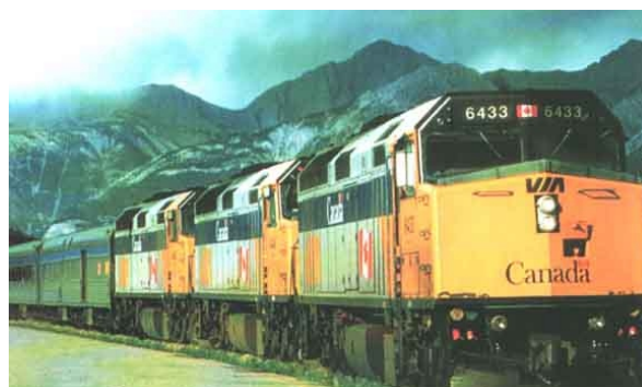
The "Canadian" during its 75 minute service stop and crew change in Jasper, Alberta.

After 2 nights and 1 day in Toronto, we arrived at the station to board VIA Rail's "flagship" train, the " Canadian ." The original " Canadian " was operated by the Canadian Pacific Railway . In 1978, VIA Rail was created, similar to Amtrak in the U. S., and took over all CP and CN passenger rail service. Initially, most passenger service was retained, but in 1988, "the Great Shrinkage" occurred when the Canadian government reduced passenger train subsidies. At that point, VIA Rail transferred the " Canadian " from CP's tracks to CN's , and reduced the frequency from every day to 3 days per week. In 1992, VIA Rail took 190 of their 1955-vintage Budd-built stainless steel cars, and spent over $200 million refurbishing them from the trucks to the domes. The result is the " Canadian " you ride now.