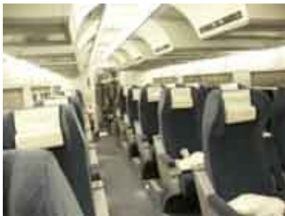
Coach Class interior