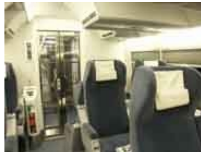
Doors leading to next car