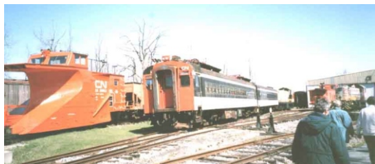
Some of the outdoor displays at the Canadian Railway Museum at Delson, Quebec.

The first "rail event" we enjoyed was a full afternoon at the Canadian Railway Museum in Delson, Quebec, which is about 20 miles south of Montreal. They have a lot of "stuff," including 140 pieces of rolling stock, but much of it is jammed coupler to coupler in two large metal sheds with poor lighting and very narrow aisles between tracks, so that we couldn't really get a decent view of any single locomotive, passenger coach, or interurban car. The rest of their collection is slowly rusting outside with little apparent preservation being attempted. They are presently constructing an $11 million "Exporail" pavilion ($7 million contributed by the Federal and Provincial governments) which will have 12 indoor tracks, an overhead mezzanine and under track observation pit, and which will house about 30 pieces of their best equipment. This will certainly improve their ability to show what they have. But there seems to be little coordination in their collection - do they really need three F-7 "covered wagons" in different paint schemes?