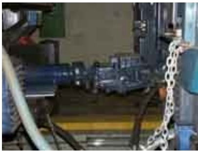
New Euro-style coupler

The Canadian Federal Government has invested $402 million dollars into its 5-year program to modernize the rail service and bring more trains, faster trains and more frequent services to Canadian travelers.