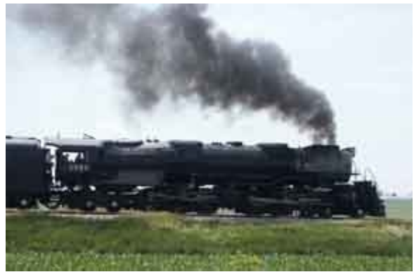
Union Pacific 3985 headed back to California.