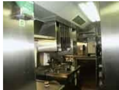
Stainless steel snack car