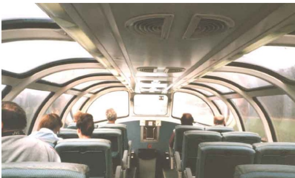
Just like 1955 on the "California Zephyr", except this was taken in 2002 on the "Canadian".

Well, when we arrived at the Toronto station, there was no train! We were informed that the 9 am scheduled departure would be delayed due to the late arrival of the train from Vancouver due to a freight train derailment in Ontario. VIA Rail personnel were very nice, and sent the entire 300 or so passengers across the street to the Royal York Hotel (built by the C. P. in 1928; at one time the 32-story hotel was the tallest building in the British Empire) to a banquet room where a big continental breakfast buffet was set up for us. Well, the 9 am departure finally occurred at 12:15 p.m! I think that if we had left on time, we would have remained on time. Unfortunately for us, the Canadian National's freight service is set up so that all westbound trains run at track speed for about 4 hours, then they all take sidings and all eastbound trains do the same. The CN is basically a single track line, with 1-mile long sidings every 10 - 15 miles, all the way from Toronto to Vancouver. We were running head-on into eastbound traffic, and stopped at nearly every siding to wait for another mile-long freight train to pass. Before we passed the 100-mile marker from Toronto, we were 4 hours late, and by the time we reached Sudbury, 260 miles from Toronto, the train was 5 hours late. Our entire first dinner was spent sitting motionless on a siding next to a pretty lake; I almost felt like we were on a "dinner train" and would return to Toronto later in the evening!