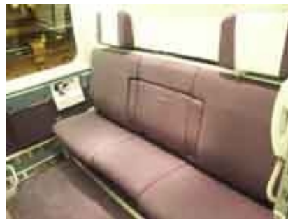
Sleeper - upper & lower berth - phone for service